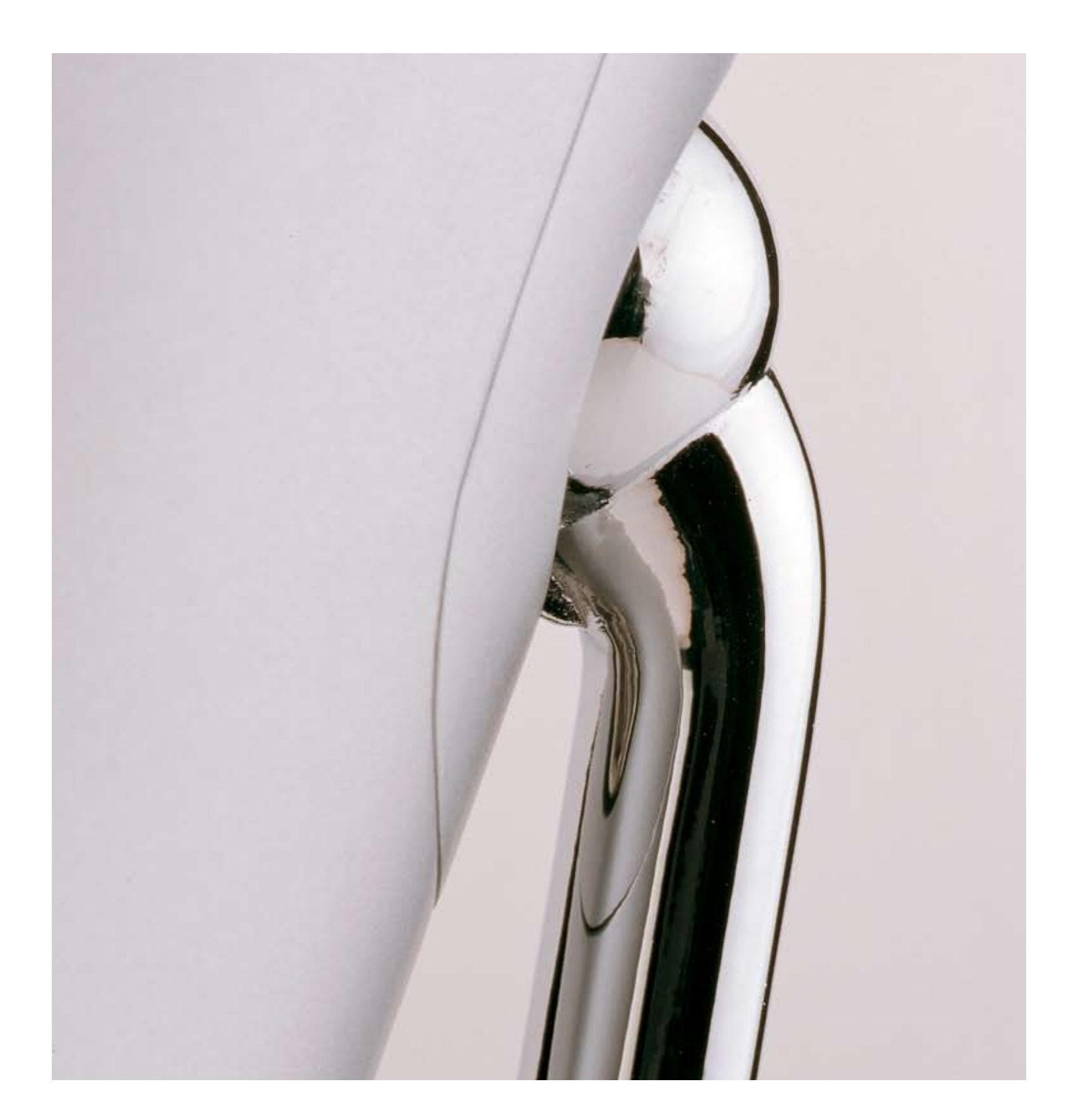
In the same way a power cable enters a well-designed table lamp at its base, and passes up through the stand, the M-1's signal cable disappears into the back of the table plinth stand, from where the signal reaches the speaker via a specially-designed, pre-wired 'arm'

When mounting a M-1 on the wall, the bracket can be wired and pre-installed, with the speaker being fitted later, in plug-and-play fashion. In the floor stand, the cable is threaded through the central column and then into the arm at the top. Now what you see is as pleasing as what you hear.